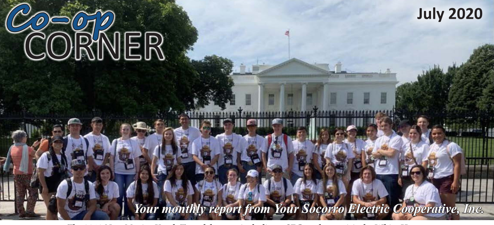
The 2019 New Mexico Youth Tour delegates, including 5 SEC students, visit the White House.